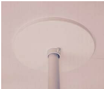
Threaded Rod secured to canopy cover.

Gem Bar: Provided with lock nuts to support rigid rod to fit inside the diameter of the canopy cover. Bar will be concealed when mounted properly. Gem bar secures to "J" Box that is supplied by others.